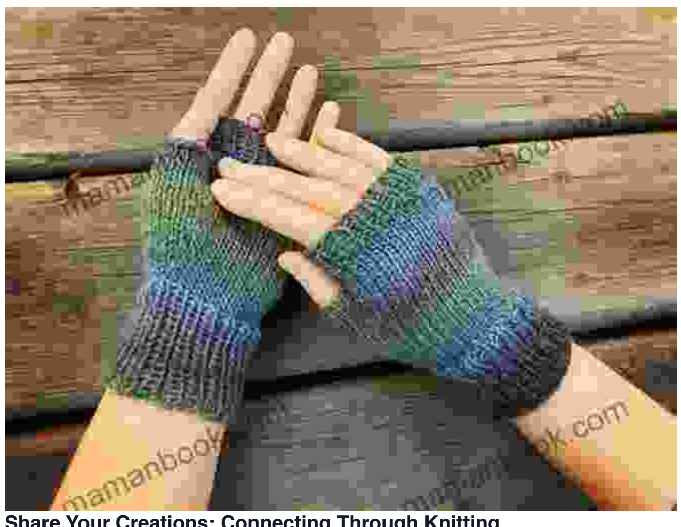
Share Your Creations: Connecting Through Knitting

We eagerly anticipate seeing your interpretations of Knitting Pattern Kp448. Share your creations with us on social media, using the hashtag #kp448, and inspire fellow knitters with your unique expressions of art and style.