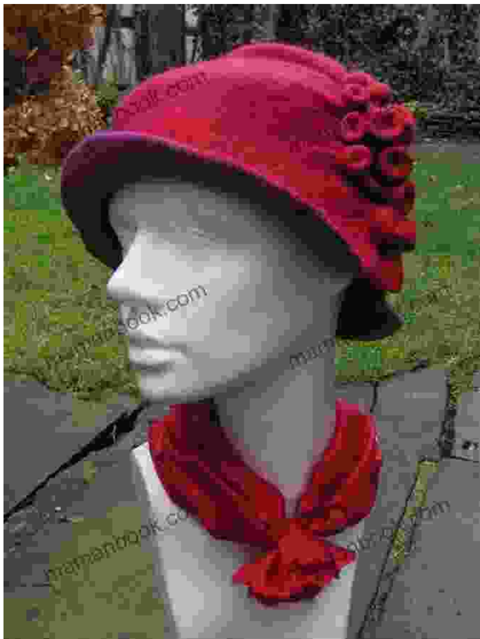
Ursula Hat Pattern Knitting Pattern Ponytail Hat Little Mermaid Witch Disney Hat Scarf Pattern Ursula